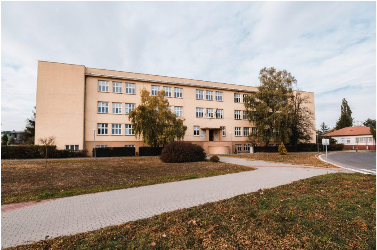
HEREDITAS SLOVAKIA Gymnázium A. Vrábla Levice 2020